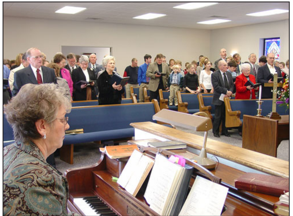
On January 28, 2007, only 10 months after an April, 2006 tornado destroyed the church, the congregation at Griffin's Chapel dedicated a new building.