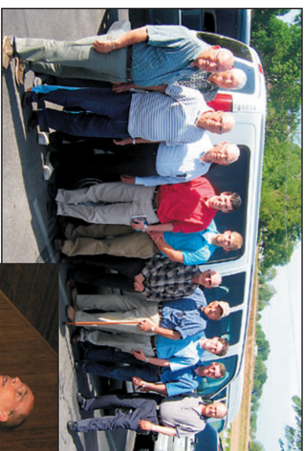
Men poured into Archer's Chapel for the annual fish fry. Church buses crowded the parking lot. Pictured above are the men from Humboldt First.