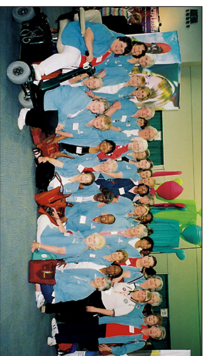
52 Memphis Conference United Methodist Women joined about 7000 other women at the Anaheim Convention Center in California for the UMW Assembly. Under the theme, "Rise, Shine, Glorify God!" the women look part in worship and workshops, exhibits and education, community building and contemplation.

She told us that on her recent trip to Latin America she learned we are called "Mission Mamas" in Latin America. Yes, because of decades of mission